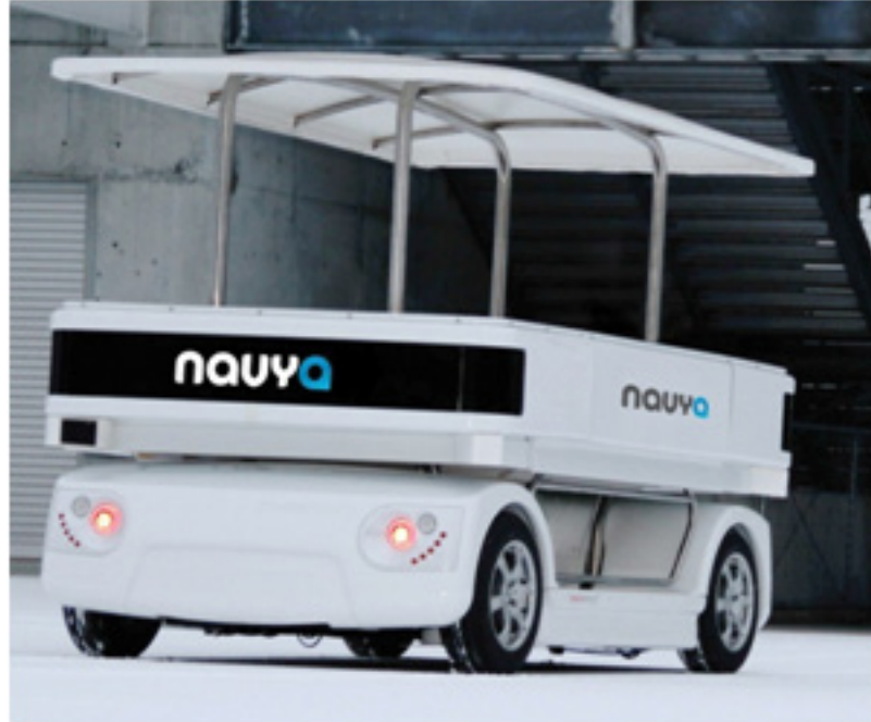
Exhibit 1 The Navya