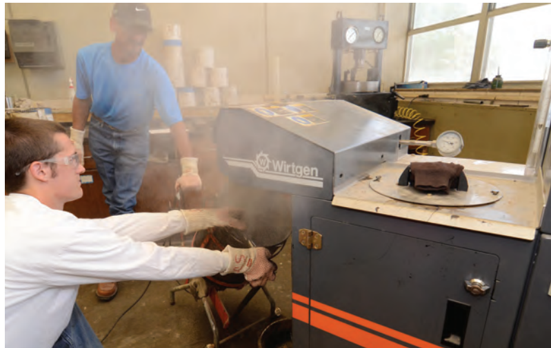
Staff members confirm proper foaming of the asphalt in TTI’s laboratory foaming plant prior to mixing test batches for the mixture design.