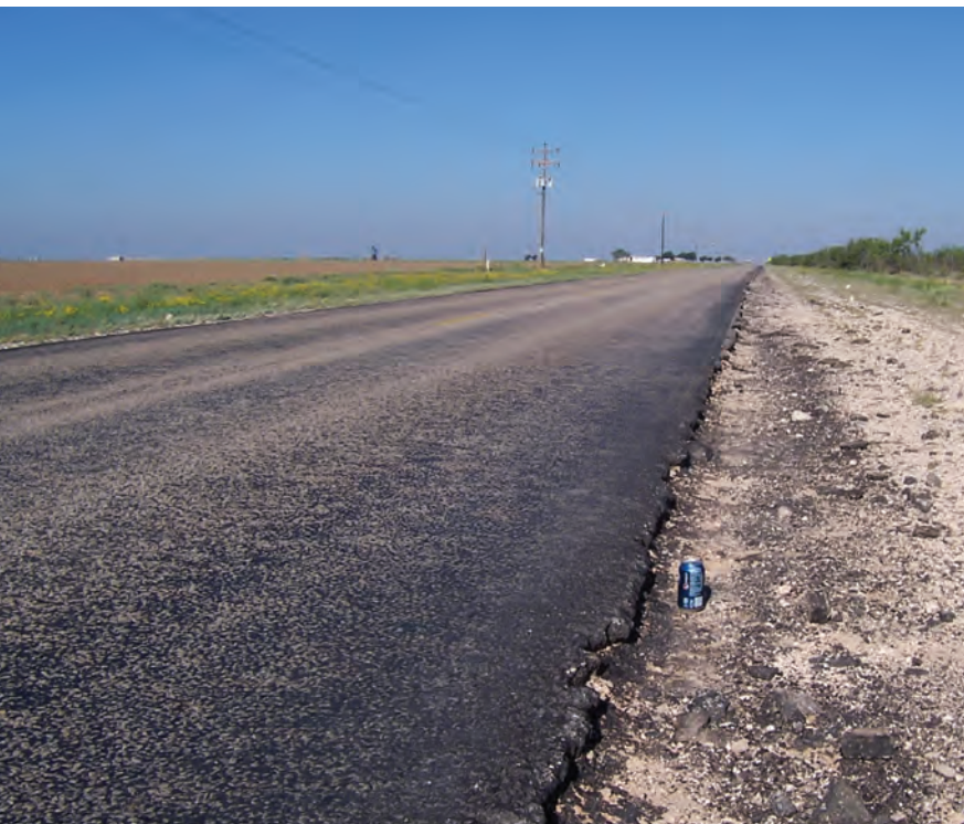
Dangerous failure at the edge of the pavement is caused by traffic loads. One of the technical briefs developed by TxDOT and TTI researchers focuses on shoulder repair techniques.

The energy sector is having a dramatic positive economic impact on Texas and the nation. But many Texas roadways have experienced accelerated pavement degradation due to heavy truck loads and increased traffic. An interagency agreement between the Texas Department of Transportation (TxDOT) and the Texas A&M Transportation Institute (TTI) seeks to give districts the necessary tools to combat this problem.