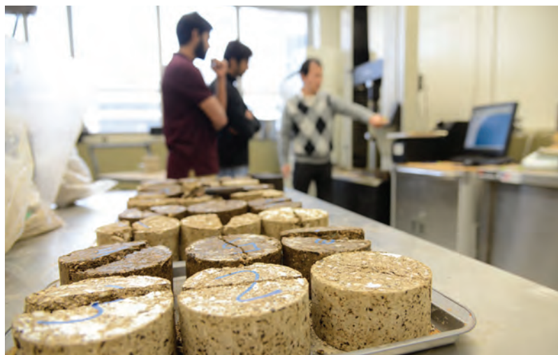
These samples of recycled pavement were treated with foamed asphalt to develop full-depth recycling options for using existing pavement in rehabilitating roadways — a more cost-effective and environmentally friendly approach compared to rebuilding the entire roadway from scratch.