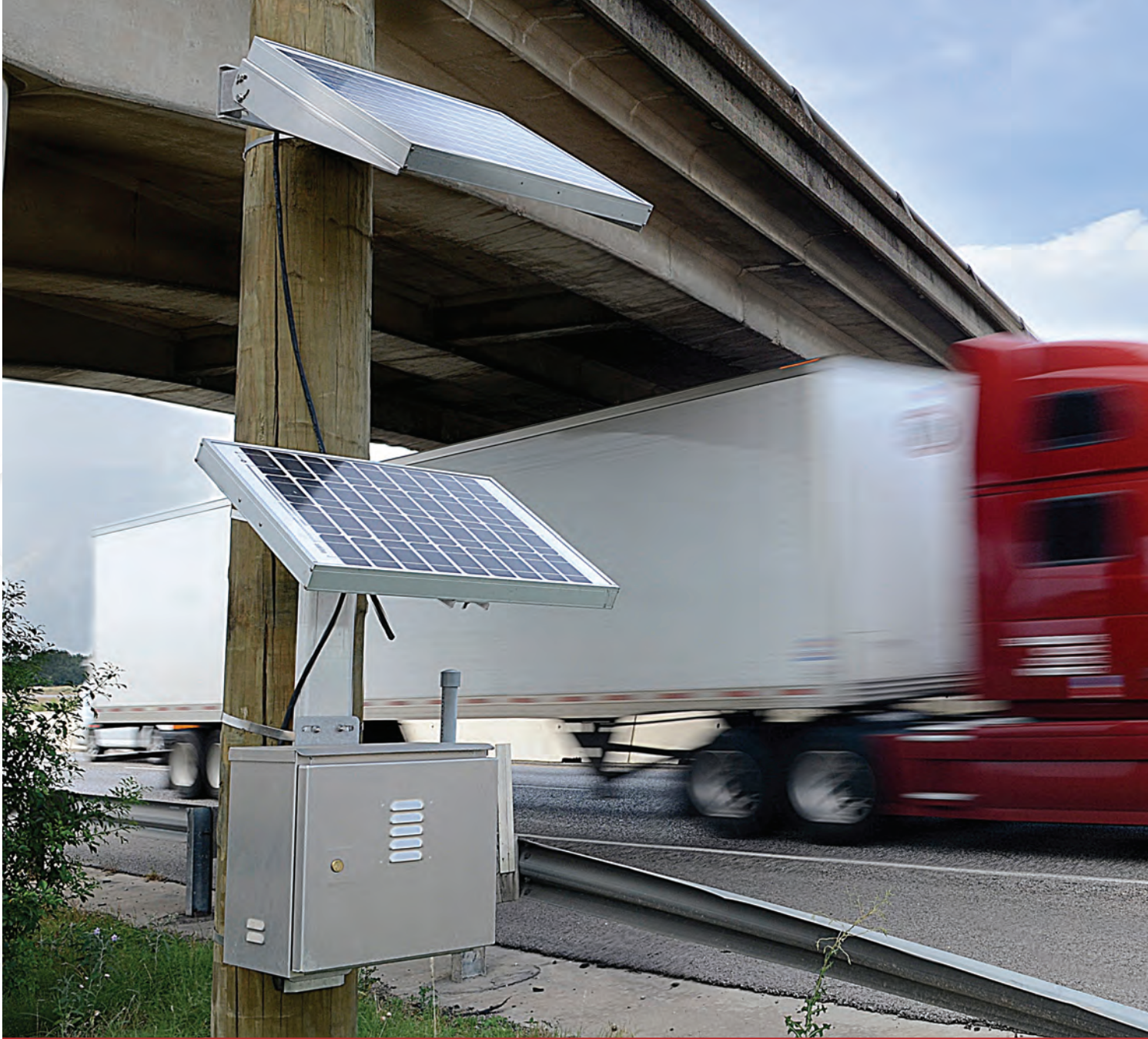
Testing how vehicles can connect to the roadside infrastructure in a safe, efficient and reliable manner is one focus for TTI researchers.