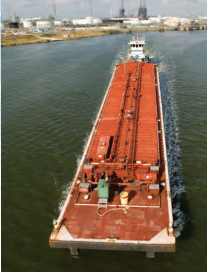
For the Texas portion of the Gulf Intracoastal Waterway to be the most efficient contributor to the Texas economy it can be, it must be properly maintained.