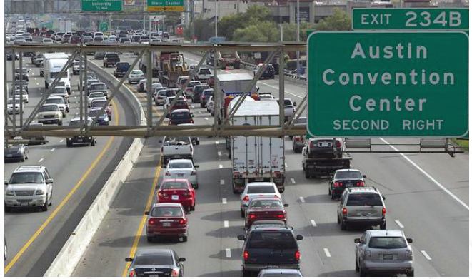
The I-35 corridor in Austin is one of the most congested roadways in Texas. Connected vehicles could help improve mobility for commuters while simultaneously improving trip safety.

“Research and testing are vital steps forward as connected-vehicle technology moves from the cutting edge to the every day. This project is a natural next step in the long-term partnership of TTI and TxDOT working together to improve transportation for Texas and the nation.”