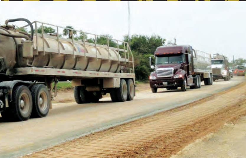
Heavy truck traffic presents challenges for maintenance crews repairing or rehabilitating roadways.