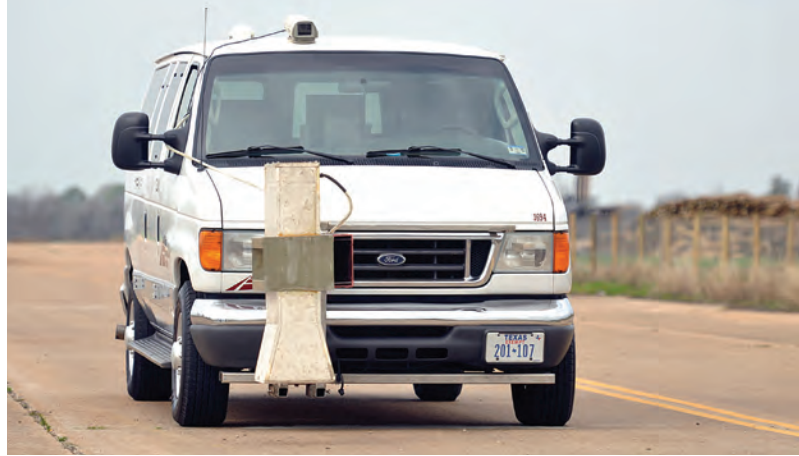
Before a road can be deemed a good candidate for foamed asphalt, engineers first have to see what’s underneath it.

For more information, contact Tom Scullion at (979) 845-9913 or t-scullion@tamu.edu , or Stephen Sebesta at (979) 458-0194 or s-sebesta@ttimail.tamu.edu .